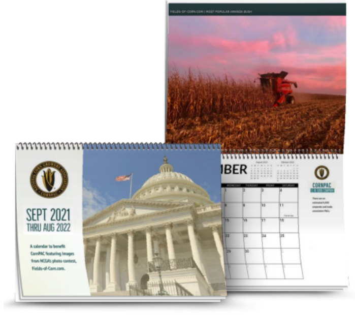
Features new winning photos from the Fields of Corn contest. To view all photos, visit Fields-of-Corn.com